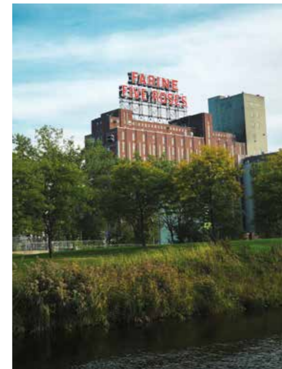
ABOVE: Mount Royal Park and downtown Montréal BELOW: Farine Five Roses sign – a protected architectural feature on Lachine Canal

of the canal's commercial use in 1970 but its significance has not been forgotten, with the area designated a National Historic Site of Canada. The canal reopened for recreational use in 2002 and is well-loved by locals and internationals alike. During my visit, small boats navigated along the smooth waters, cyclists shared the canal path with pedestrians and,