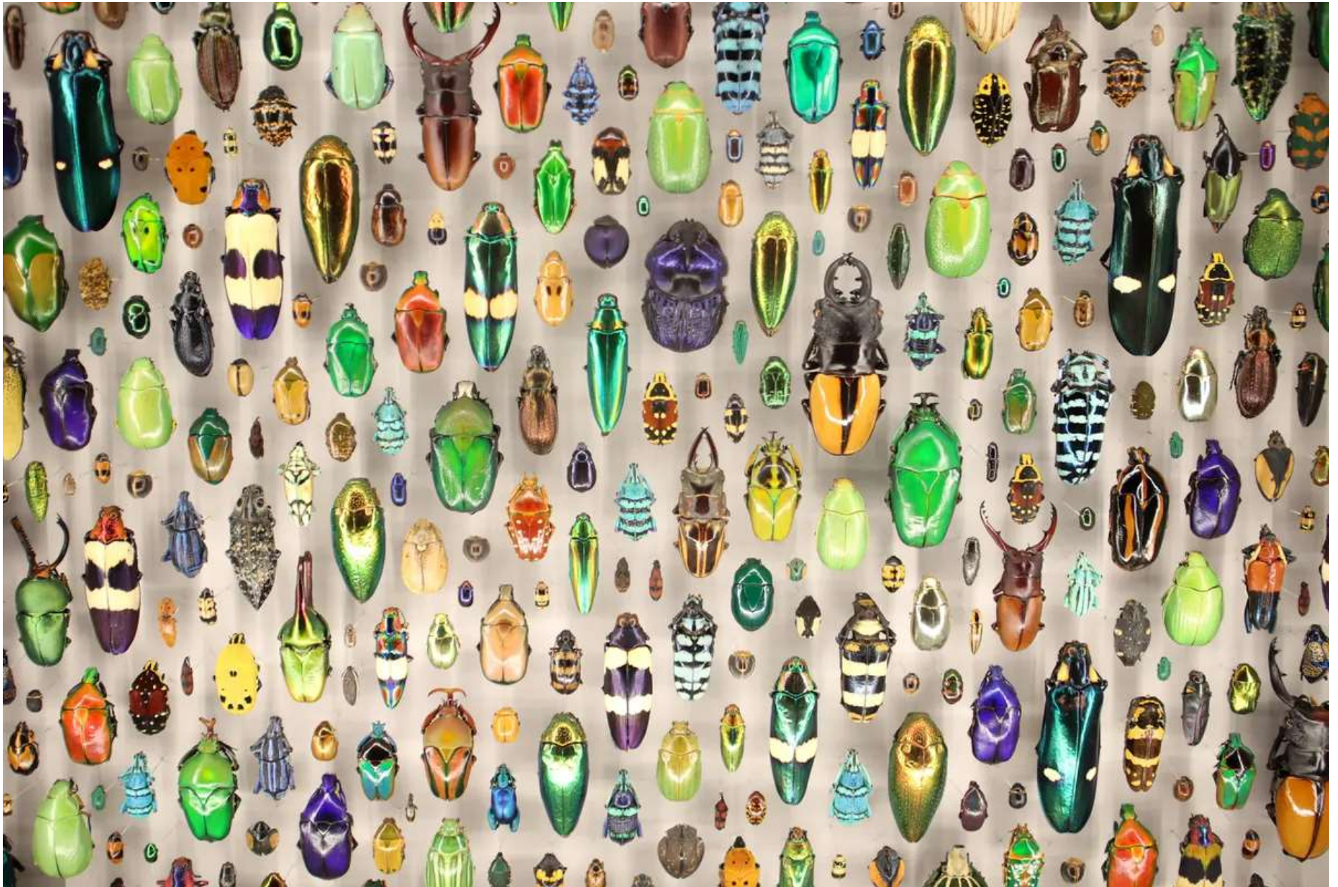
An exhibit showing various insects specimens.